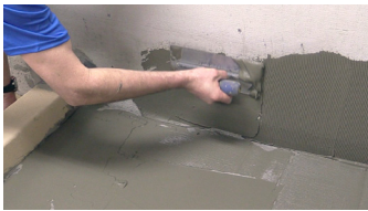
Apply bonding agent