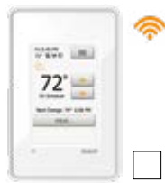
DITRA-HEAT-E-WIFI Programmable Wi-Fi