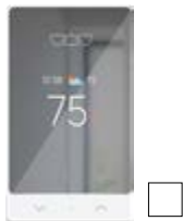
DITRA-HEAT-E-RS1 Smart Thermostat