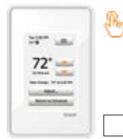
DITRA-HEAT-E-RT Programmable Touchscreen