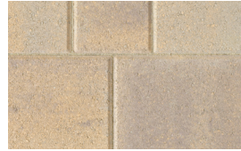
TUSCAN WITH TAN SAND