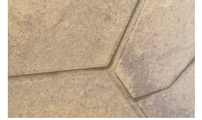
SAND-STONE-MOCHA WITH TAN SAND