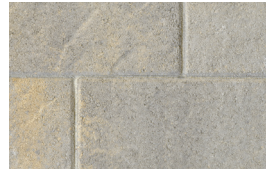
GRAY-COPPER-CHARCOAL WITH GRAY SAND