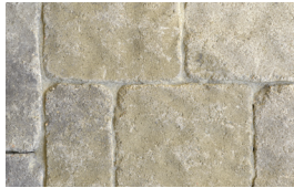
GRAY-MOSS-CHARCOAL WITH GRAY SAND