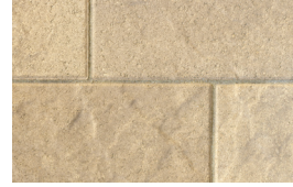
ADOBE-COPPER-MOCHA WITH TAN SAND