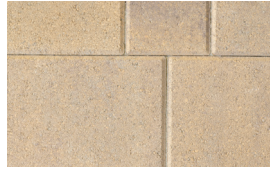
TUSCAN WITH GRAY SAND