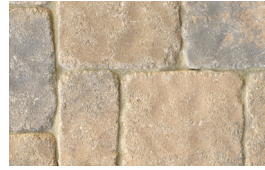
CREAM-BROWN-CHARCOAL WITH TAN SAND