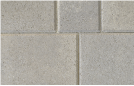
DARK GRAY-PEWTER-CHARCOAL WITH GRAY SAND

Blended Colors (swatches shown in Courtyard Stone, Estate Cobble, Pavilion, and Slaton)