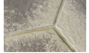
GRAY-CHARCOAL WITH GRAY SAND