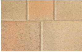
CREAM-TERRACOTTA-BROWN WITH TAN SAND