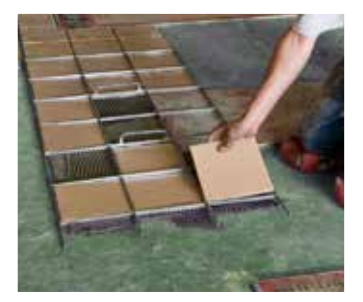
Visit our website for complete in-depth instructions, diagrams, and how-to videos on all Noble products.