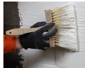
Apply using brush or spray