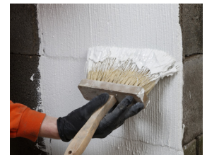
Finish using vertical brush strokes